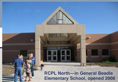
RCPL North—in General Beadle Elementary School, opened 2008