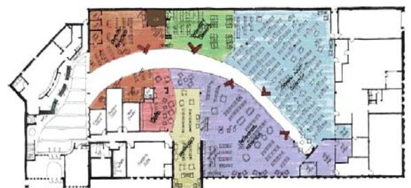
2007 Space Reconfiguration Plan